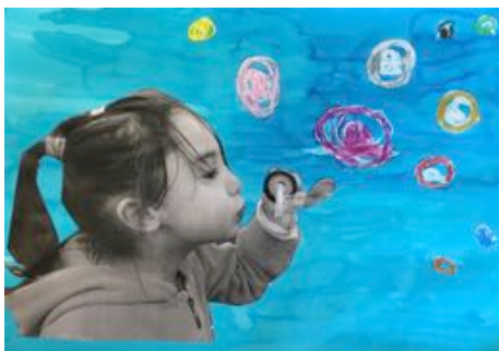
I like bubbles. Bubbles make us happy. Bubbles are colourful. Bubbles can pop! By Emma McCallum