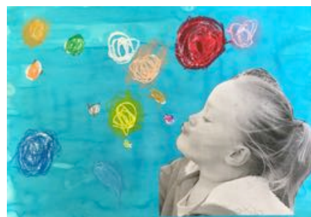
I like blowing bubbles. They are fun to play with. By Khloe Squire