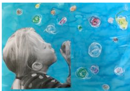
We were popping bubbles and they flew up. By Quesha King