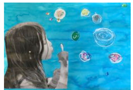
I like popping green bubbles. By Mia Lindsay